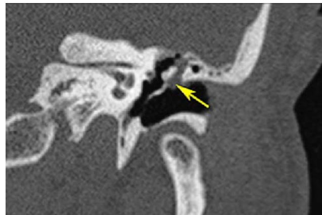
Fig. 3 – Cone beam computed tomography (CT) of temporal bone (arrow shows soft tissue of the attic cholesteatoma).