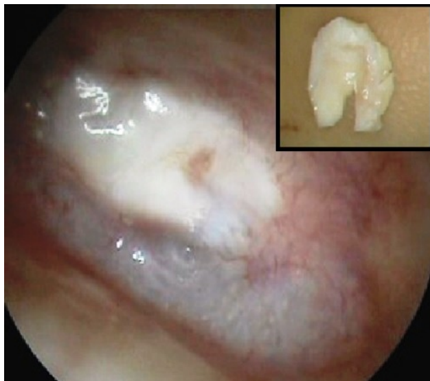
Fig. 4 – Postoperative otomicroscopy finding with a shaped piece of auricular cartilage for attic wall reconstruction of the middle ear.

A special issue is whether there is any chance to manage early attic retraction pocket before it becomes a surgery problem. Deep attic retraction pocket is an indication for surgery nowadays, according to some surgeons 10 , bearing in mind the fact that attic retraction pocket eventually leads to attic cholesteatoma appearance. How to manage the attic retraction pocket?